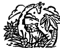
Be a good steward of God's creation