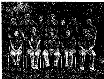
NET Team #2

*If your child(ren) will be absent from RE, you need to call the office to inform Amber or Irene!