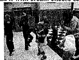
Ice Cream dance at Dairy Queen