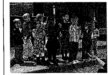
Preschool children performing a "Sneak Peak" of the Risen Savior Christmas Program for Young At Heart Luncheon